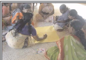
SPED II: Women from Fathimanager Village watershed area using PRA mapping tools for local planning (Marthandam Integrated Development Society, Tamil Nadu)

All program activities involve grassroots participatory approaches (eg. participatory rural appraisal/PRA, participatory action research) that promote and support local level knowledge and empowerment through capacity building of stakeholders.